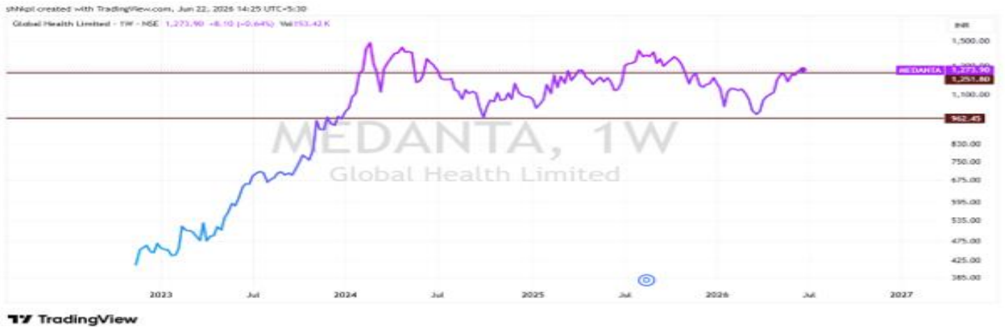
Exhibit 5: MEDANTA – Weekly chart