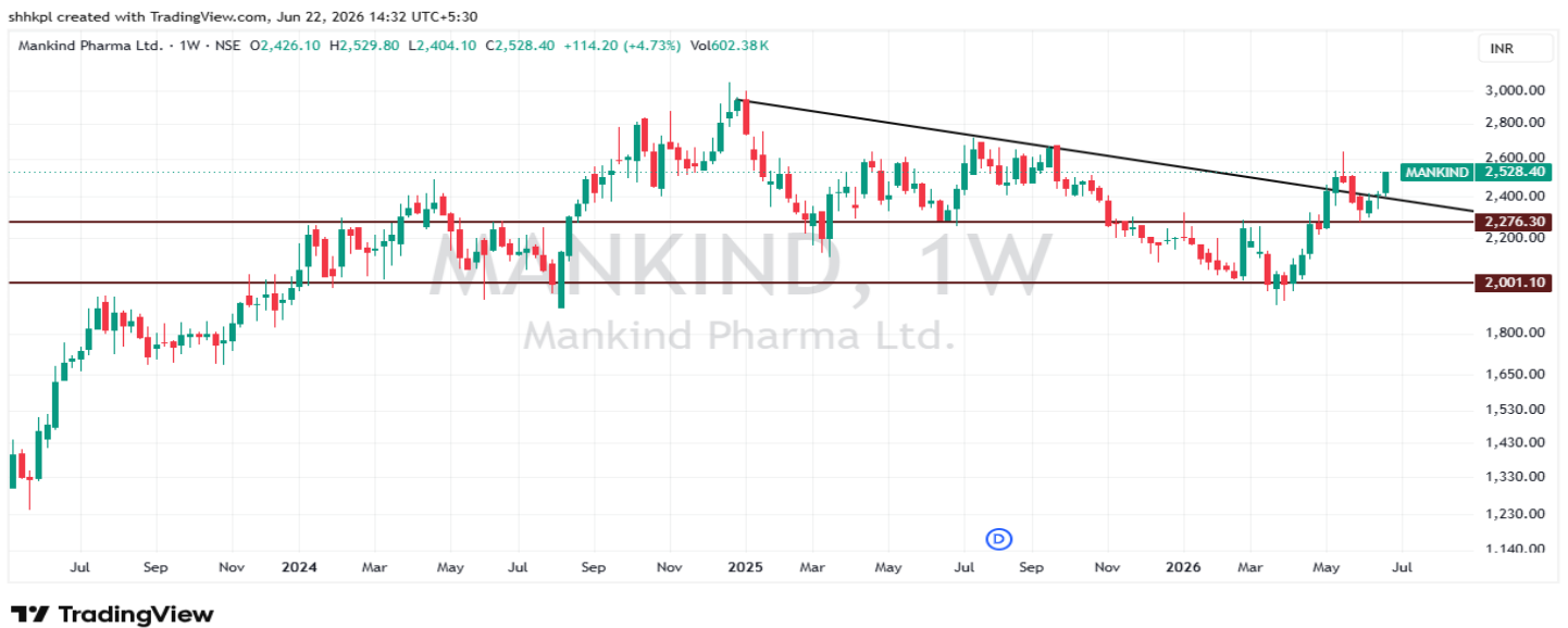
Exhibit 6: MANKIND – Weekly chart