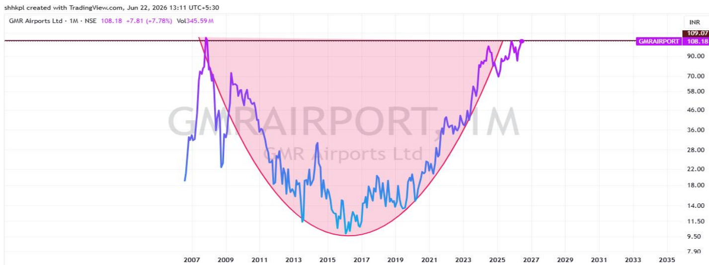
Exhibit 4: GMRAIRPORT – Monthly chart

GMRAIRPORT: Accumulate – 108 to 102 (5%); SL – 97 (9%); TGT – 130 (20%)